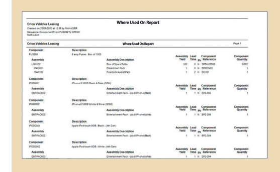
Where Used On Report

"Opera 3 was an easy choice as it combined finance, supply chain and service functionality within just one system – harnessing all of our critical data and enabling us to manage our business growth successfully"