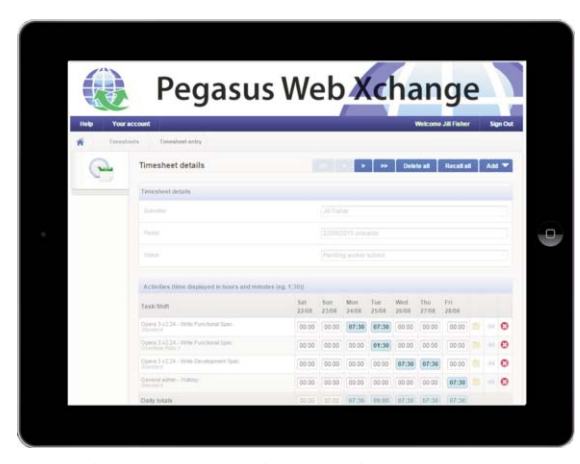
Employees can enter their timesheets remotely on any device

For added flexibility, any employee can be defined as "No Payroll Update", which means that they can enter timesheets but these will not be transferred to Opera 3 Payroll. This is useful if the employee is salaried and does not get paid based on hours worked, or is a contracted employee.